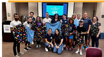
Anti-Cruelty Society Volunteering 2023

We support our communities, and we want to help you support yours. Our at-discretion giving program allows you to contribute to a charity of your choice, and the firm will make a matching contribution.