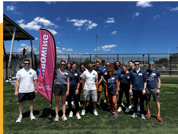
Special Olympics, 2024

AWARENESS BELONGING RESPONSIBILITY INCLUSION EQUITY DIVERSITY