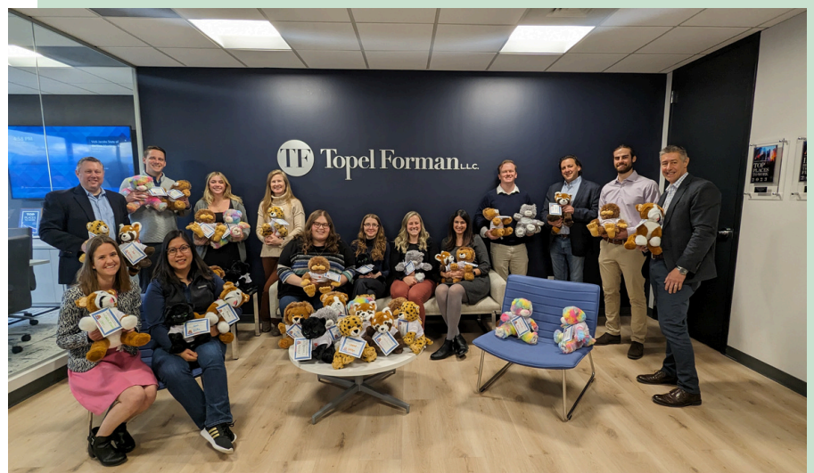
Denver Office, 2024

Welcoming a child to your family is one of the most joyful experiences in life, and we want you to be able to enjoy and adjust. Whether you are a biological parent, adopting, or fostering, eight weeks of parental leave are available, starting day one of employment.