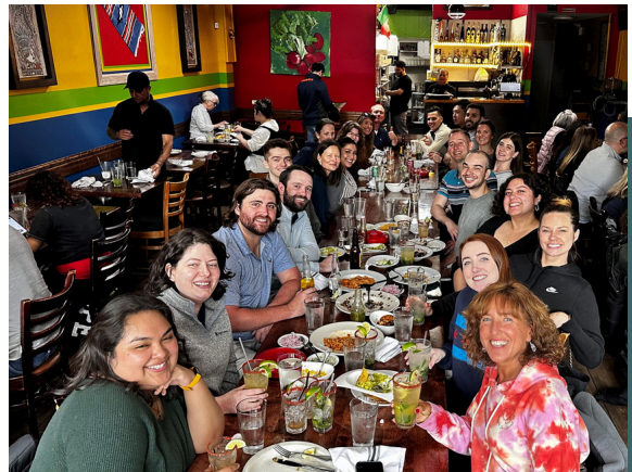
Allies Outing, 2024