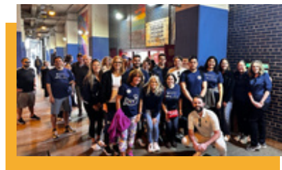
Veteran's Support 5k, 2024