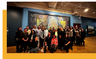
Allies Mexican Art Museum, 2024