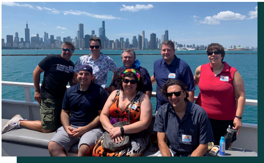
Partner Group, Summer Outing 2022