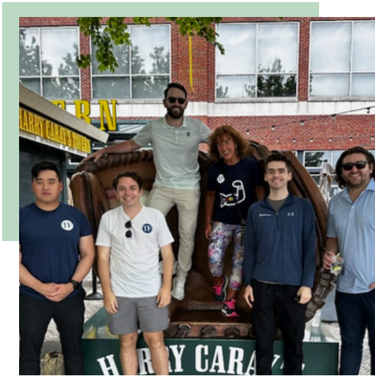
Group at Allies Museum Event, 2024

Our generous PTO program allows employees to balance their personal and professional lives. A minimum of 25 days per year is available to eligible employees. Time off can be used for any reason, including vacation, illness, and personal time.