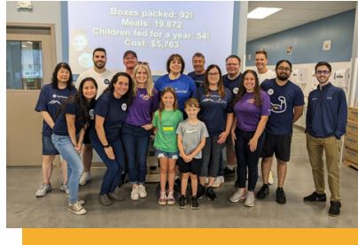
Feed My Starving Children, 2023

Happy birthday to you! Every year on your birthday the firm will donate $100 to a charity of your choosing.