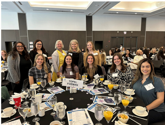
Illinois CPA Society Forum For Women, 2024

Our mission is to provide a safe space to encourage, enable, and facilitate women's active involvement and success in the Topel Forman workplace by educating ourselves and providing resources to support and mentor women to achieve their full potential, thrive, and believe in their ability.